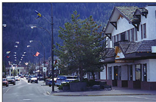
The town of Smithers, BC

The Community Development Institute at UNBC is interested in two fundamental issues for communities in northern BC: community capacity and community development. By undertaking research, sharing information, and supporting education outreach, the Institute is becoming a vital partner to communities interesting in making informed decisions about their own futures.